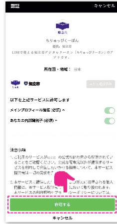
2 Tap "Allow"