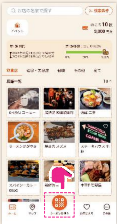
5 Tap Use coupon