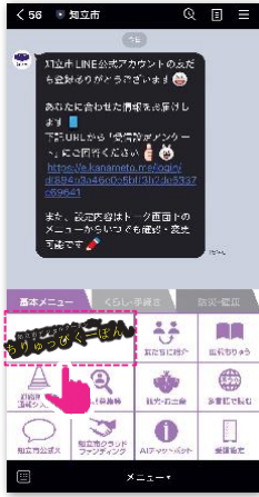
1 Tap on the coupon