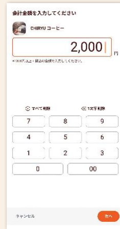
7 Enter payment amount