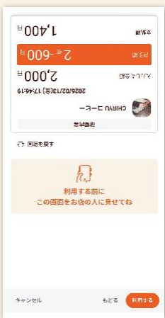
9 Double-check and proceed