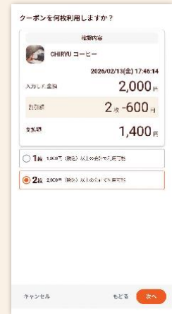
8 Choose the amount of coupons