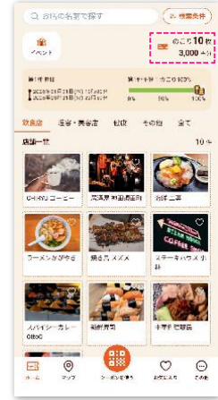
4 Receive ten (10) ¥300 coupons