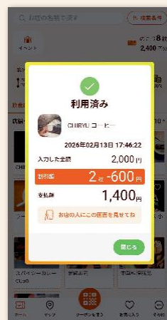
10 Coupon redeemed